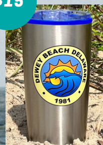
20 OZ. TUMBLER