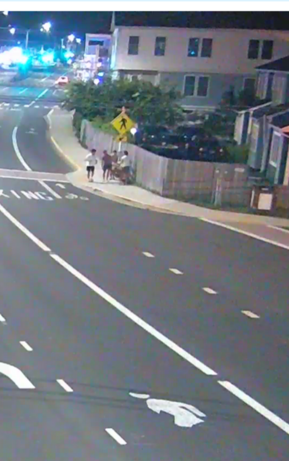
Houston Street (Clayton St. bench)

DEWEY BEACH POLICE ARE INVESTIGATING THE THEFT OF TWO TOWN OF DEWEY BEACH BENCHES THAT WERE STOLEN DURING THE EVENING OF AUGUST 1ST AT 2:40AM ON CLAYTON STREET AND AUGUST 5TH AT 5:11AM ON SWEDES STREET. IF YOU HAVE ANY INFORMATION REFERENCING THESE TWO THEFTS PLEASE CALL THE DEWEY BEACH POLICE DEPARTMENT AT (302) 227-6363.