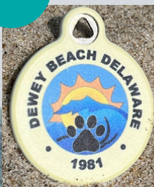
SOUVENIR LIFETIME DOG TAG