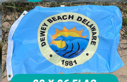
23 X 36 FLAG