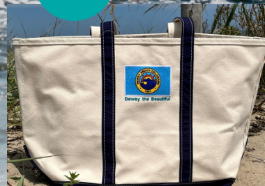
LL BEAN TOTE BAG