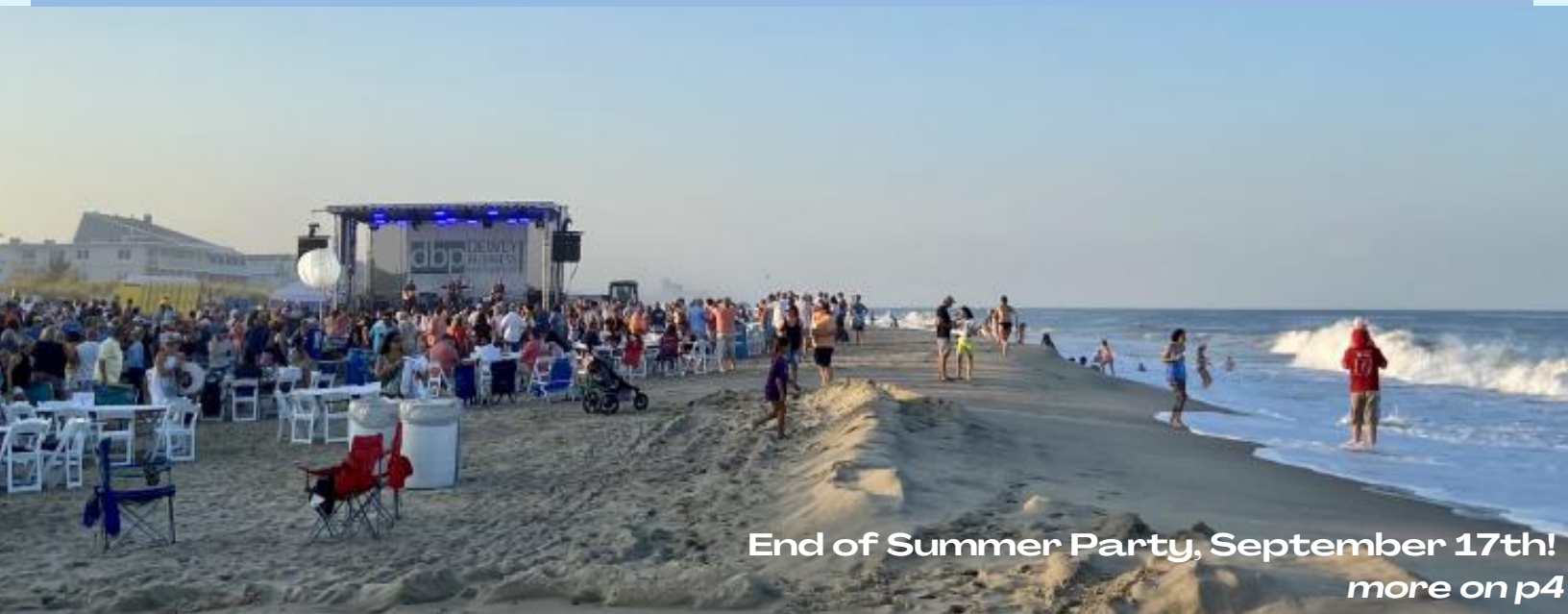
End of Summer Party, September 17th! more on p4